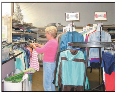
a volunteer hard at work

It takes many volunteers to help those in our local communities who are having a tough time and who come to Lake Country Caring for their family's needs. In 2010 recipients made 3,751 visits for clothing, furniture, personal care and/or household items.