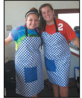
"key clubbers" hard at work washing cars and selling burgers